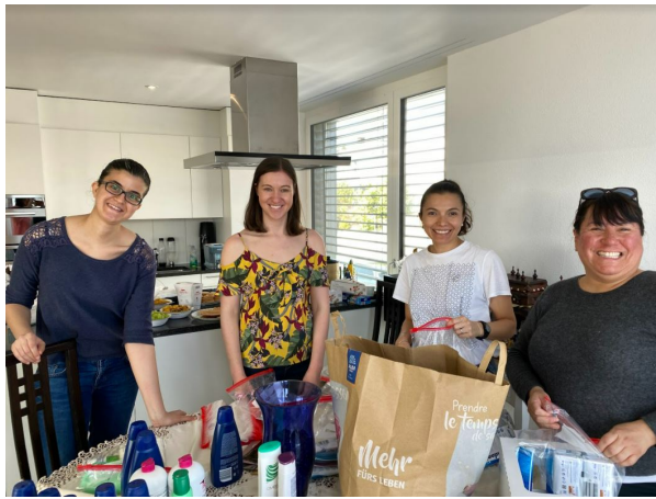
Some of our volunteers packing the Personal Care Kits