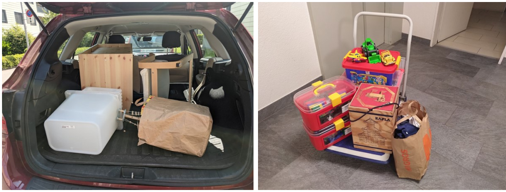
L: Items for a new Frauenhaus Playroom, R: Items headed for a Playgroup for children learning fine motor skills