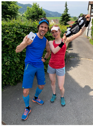
Some of the race winners from POLARIS and Axiom Asia