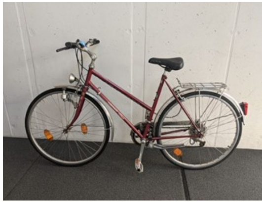
One of the many great bicycles from Google staff!