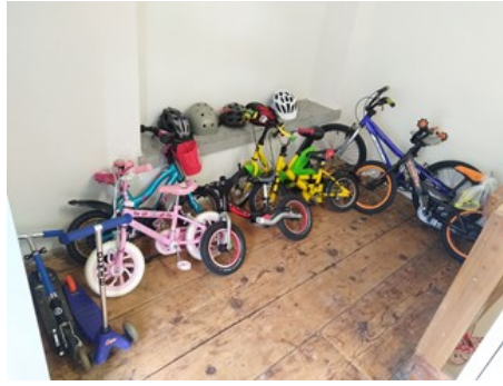
L: Volunteers at a Collection Site, R: Bicycles Drop Off at a Local Agency