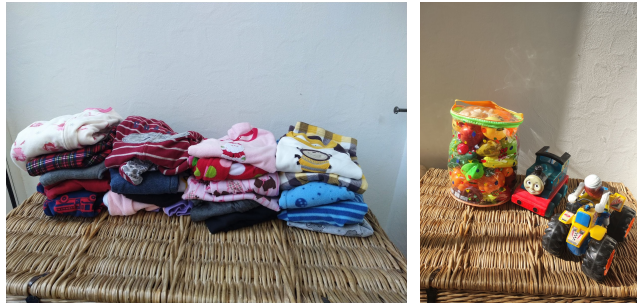
Some examples of our previous donations